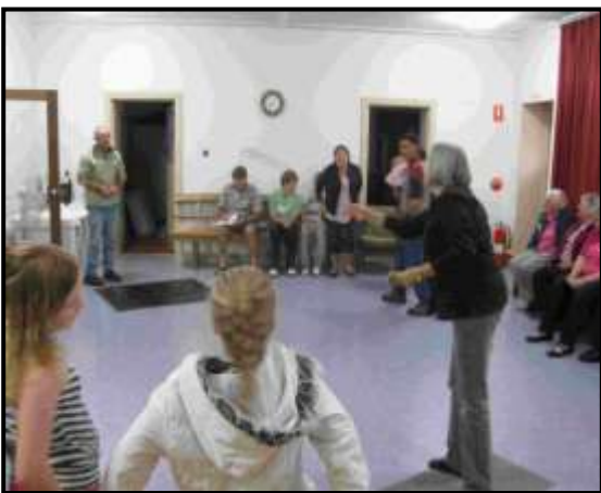
Tossing the Pancake frisby-style