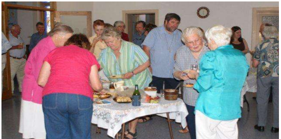
Fifth Sunday at Minlaton