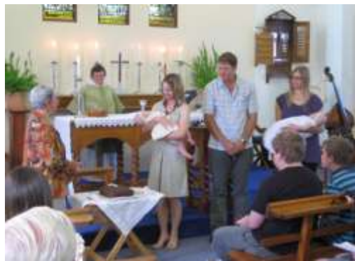
MU Baptismal cake presentation

P.S. So the name Cook continues to grow and flourish in Minlaton. Next month sees yet another double baptism at St. Ben's and yet another two Cooks! Is there no end to this dynasty?