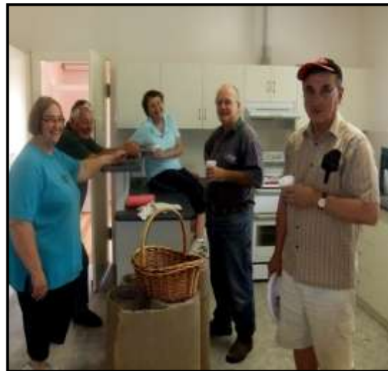
Clean-up at Rectory